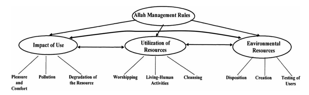
Fig. 2. Diagram illustrating the Islamic Approach to Environmental Management (IAEM).

Moslems are given all natural resources, personal goods and graces from Allah such that Moslems should work for their subsistence and sustenance to sustain in this world (to live, grow and be healthy) and in the hereafter (to use it wisely, think about the creation of food in search for its development, and thank and