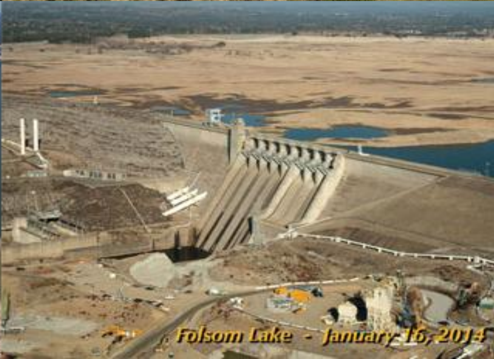
Folsom Lake - January 16, 2014