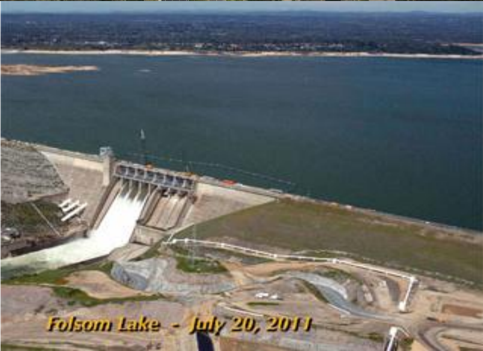
Folsom Lake - July 20, 2011